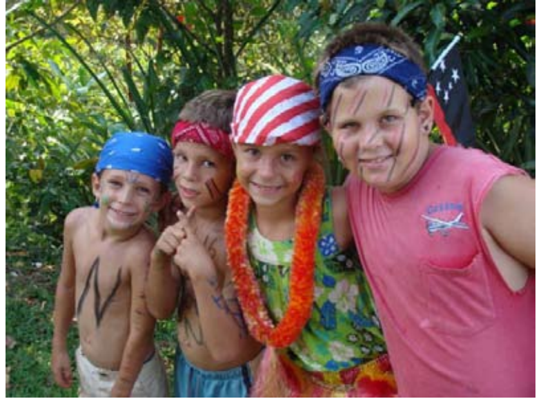
Kids dressed up for PNG Independence Day