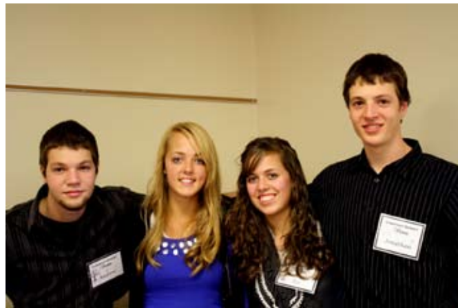
SR HI Chestnut Street Visions