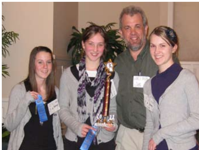
SR HI Honey Brook Passions