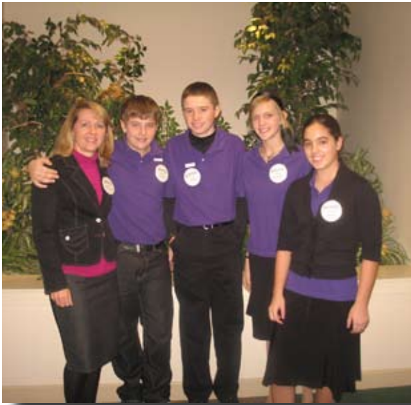
JR HI Rockville Servants