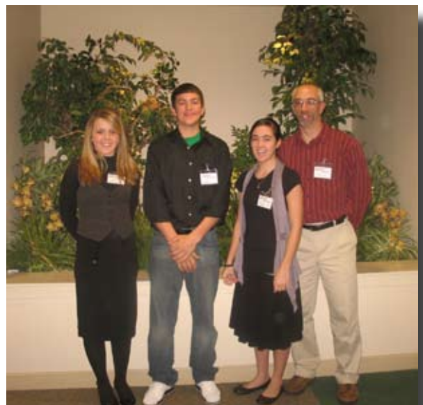
SR HI Rockville Earthquake