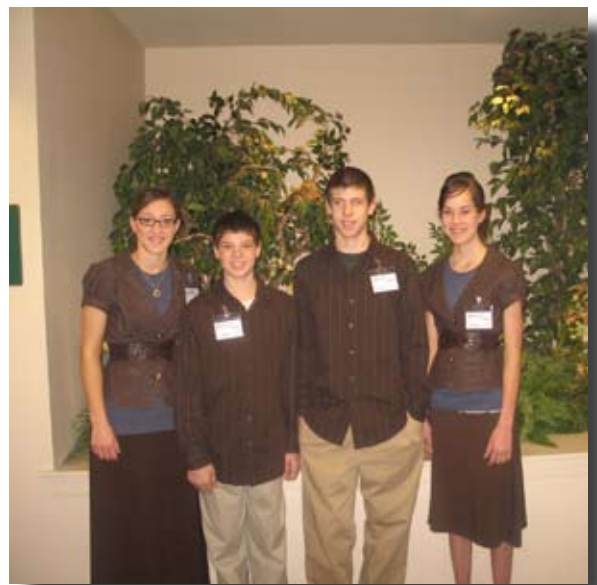
SR HI Rockville Promise