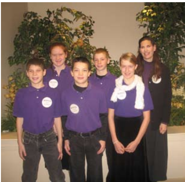
JR HI Rockville Prophets