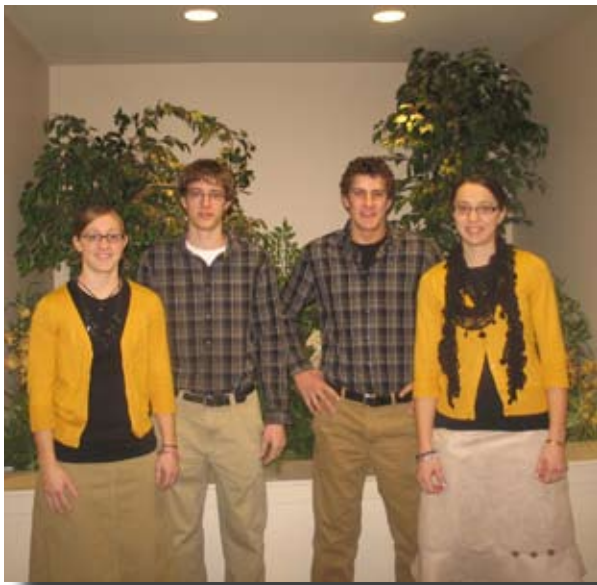
SR HI Rockville Ordained