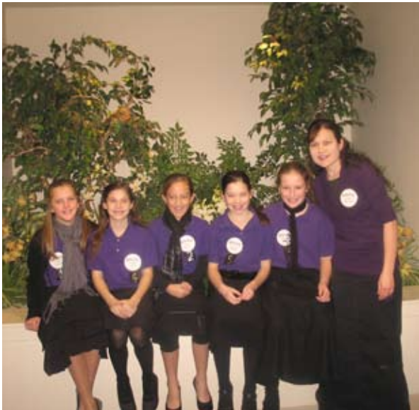
JR HI Rockville Miracles