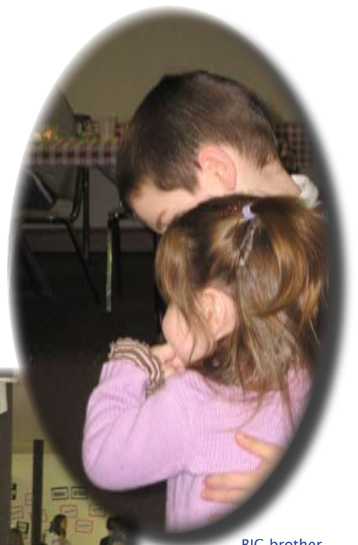
BIG brother, little sister

Thank you to all! both the Youth Group and those who attended. It was a fun filled evening.