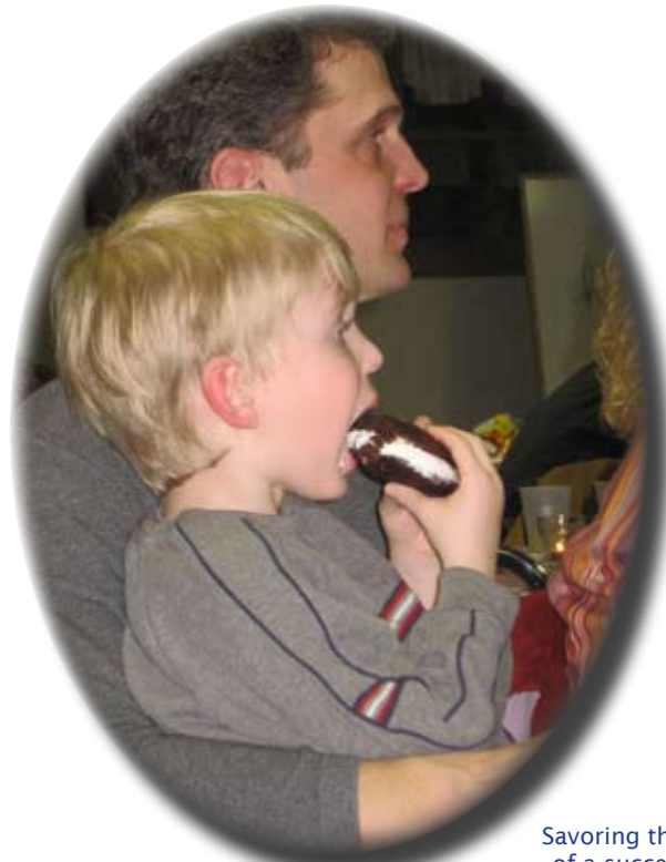
Savoring the benefits of a successful bid.