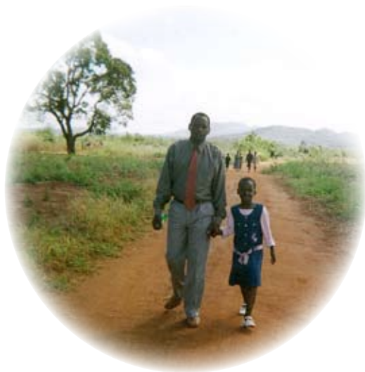
on the way to church with his daughter